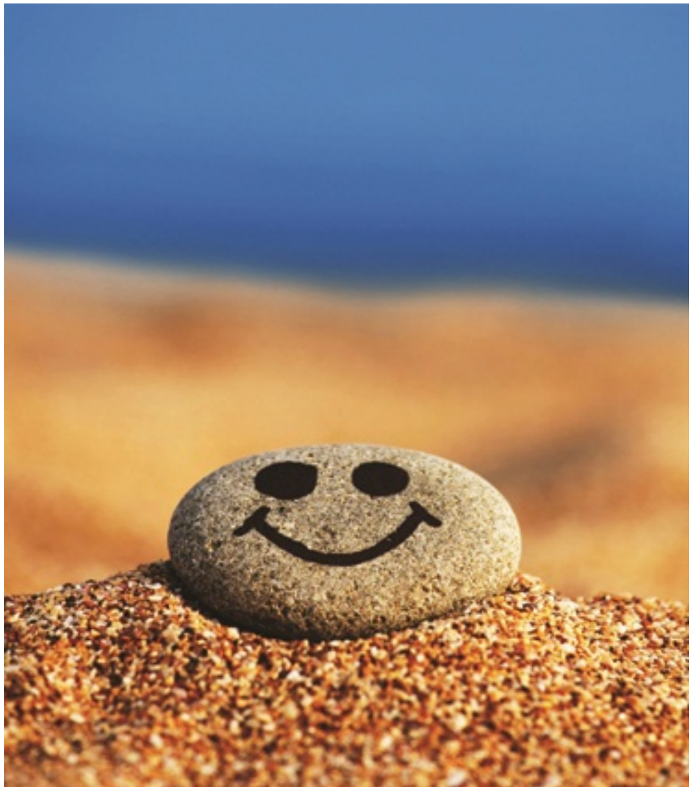
The value of bodywork runs deep, for nothing is more valuable than good health.

Truly, massage is more than a luxury--it's a vital part of self-care that has a positive ripple effect on you as you work, play, and care for others. Investing in your health is one investment that's sure to pay off.